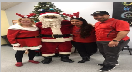
Some Pictures from the Bristol Boys & Girls Club Holiday Parties at Cambridge Park.....

Please do not bring shopping carts on the premises or you will get charged a fine.